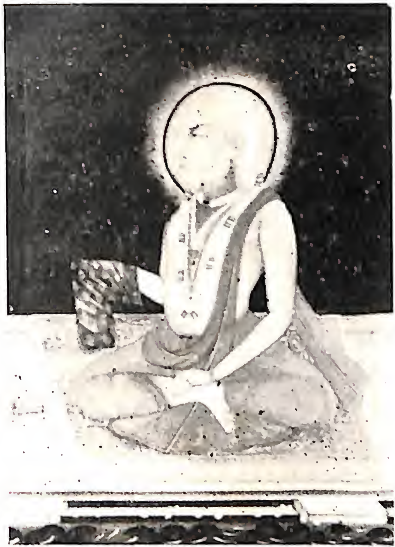
Goswa ni Shri Vithaleshvara See page 342